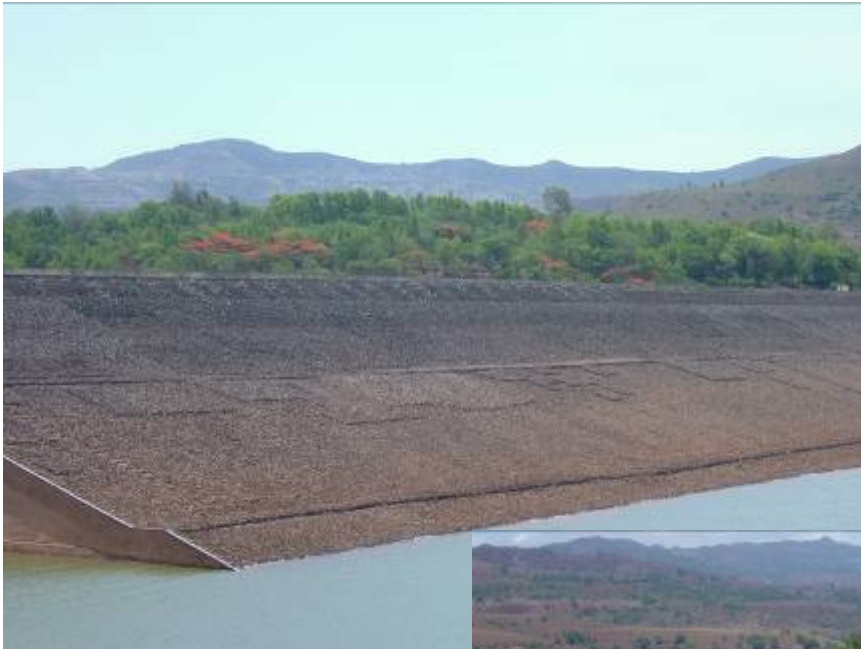
Irrigation dam Near Pune, India June 2007