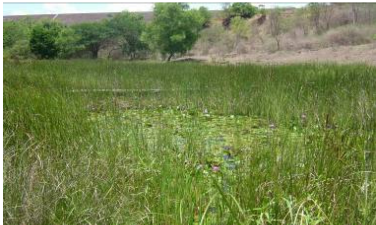
Downstream wetland restoration, 30 acres