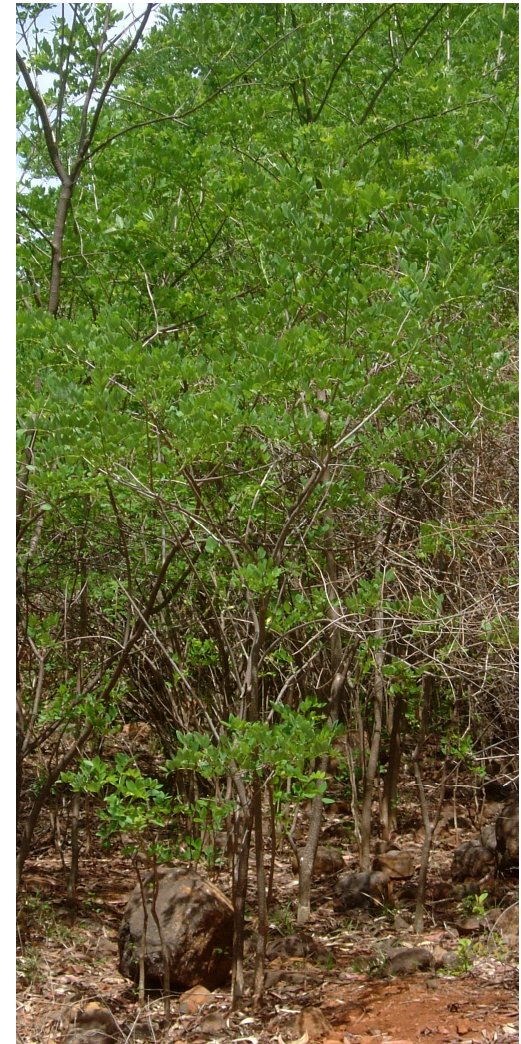
Upstream forest restoration, 50 acres