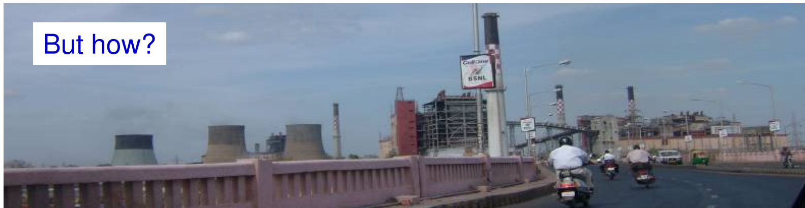
Ahmedabad power station, June 2007